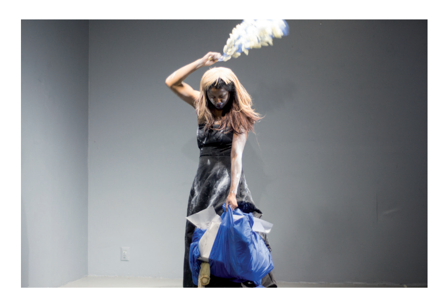
Act III, Fig. 11: The artist carries her props by wrapping the objects in blue fabric. Above her head, she swings blue tulle fabric that is adorned with dozens of latex finger cots. Blues\Blank\Black performed at Five Myles Gallery on May 21, 2016 in Brooklyn, New York.