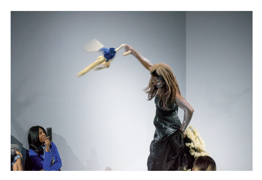
Act III, Fig. 10: The artist violently swings a plush Brer Rabbit toy. The toy rabbit is a nod toward the impact of Uncle Remus folktales upon the novelist Toni Morrison, specifically the story of Brer Rabbit and the Tar Baby. Morrison's novel Tar Baby was published in 1981. Blues\Blank\Black performed at Five Myles Gallery on May 21, 2016 in Brooklyn, New York.