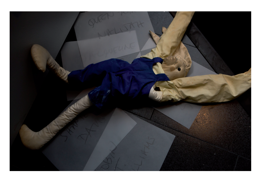
Act III, Fig. 12: The plush Brer Rabbit doll is left on the gallery floor as part of the performance.