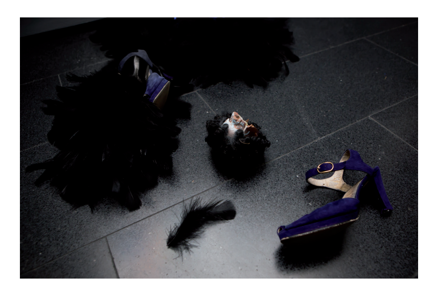
Act I, Fig. 5: Objects used in Act I include a pair of worn-out blue suede heels, the broken porcelain baby doll head, and a black feather boa. They are left on the floor of the gallery as the piece transitions from Act I to Act II.