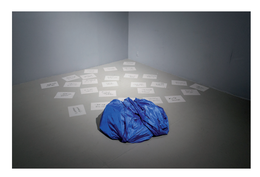
Act I, Fig. 4: The names of the deceased African American women and a bundle of props are placed in the corner of the gallery. The corner itself signifies being backed into a location from which there is no escape. Blues\Blank\ Black performed at Five Myles Gallery in 2016.