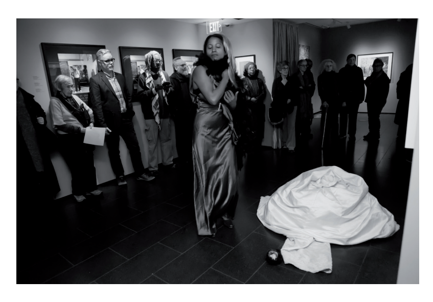
Act II, Fig. 6: Still dressed as Azul, a bluesy nightclub singer, the artist caresses her wig before changing into the wedding dress on the gallery floor for ACT II.