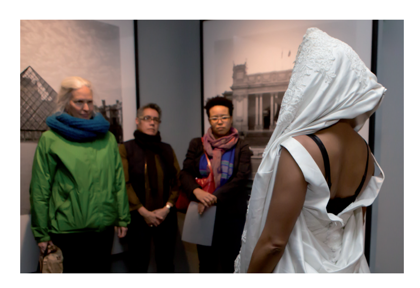
Act II, Fig. 8: During ACT II, as La Sucia , the artist raises the wedding dress over her head to both expose and hide herself from the viewer.