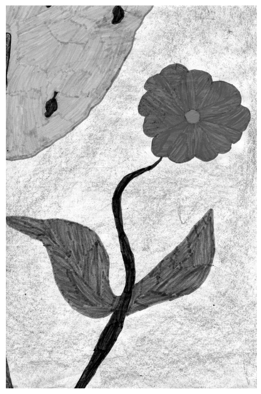
Fig. 2: The utöparané turns red, like blood. By Marlito Nõ'rõ're.