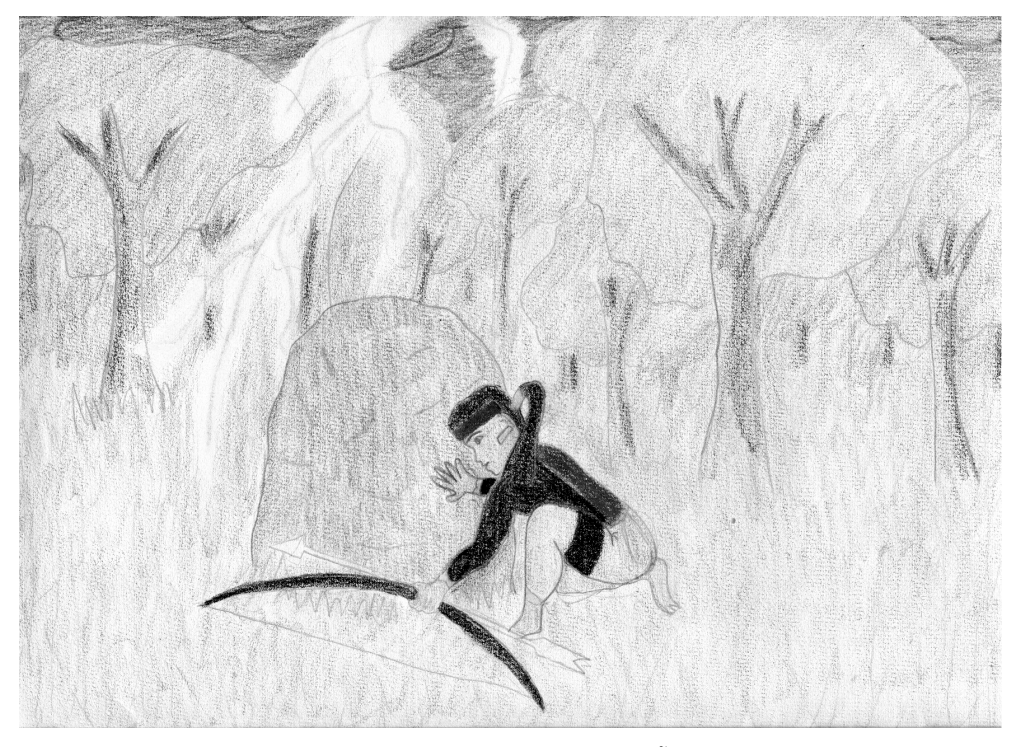
Fig. 4: Where is Joaquim? By Décio Õmõhi.

"This T-shirt, it could be the blood of a dog, a cat, a horse!" This is what the police say, the blood of our relative is the blood of an animal! "You stole the farmer's stuff, give it back." This is what the police wants, the cars, the tractors. [...] But they want our land, blood, plants, fruits and flowers, the Savannah, they want our life! How can you destroy the Savannah to plant only soy, rice, cotton? How can you burn the land, kill all the animals? How can you kill the old man, take all his blood away and keep the body? We want the body, to bury it in our cemetery, but they don't give it back. So we will not give their stuff back, either. And we don't want the waradzu traveling back and forth on the Highway, either. So we put up a roadblock, here it is (showing the drawing). All cars have to stop and pay toll. A real beautiful car pays more -50 reais . If the waradzu is poor and only has an old car we only charge 20 or 30.