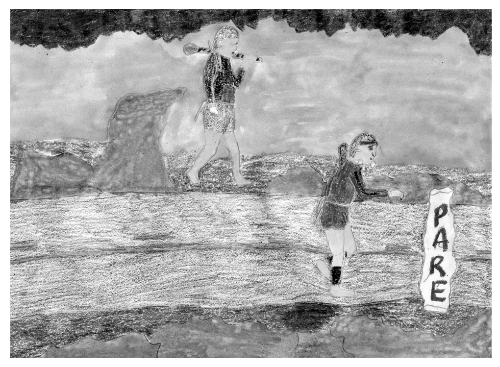
Fig. 5: Waradzu paying toll.

[...] The police say they are going to have an investigation, that is what the Xavante want. Is the police investigating? No! Only thing they do is take the T-shirt to his wife in Volta Grande (village) and ask her if she knows her man's clothes! She washes his clothes everyday in the river. She is crying: "It belongs to my husband"! [...] The wife wants the body, but the police give her nothing. Now the farmers want their stuff back. They send a message to the Xavante: "We will give you 200 thousand reais (70,000 dollars) if you return our equipment. [...] The body is not for sale.