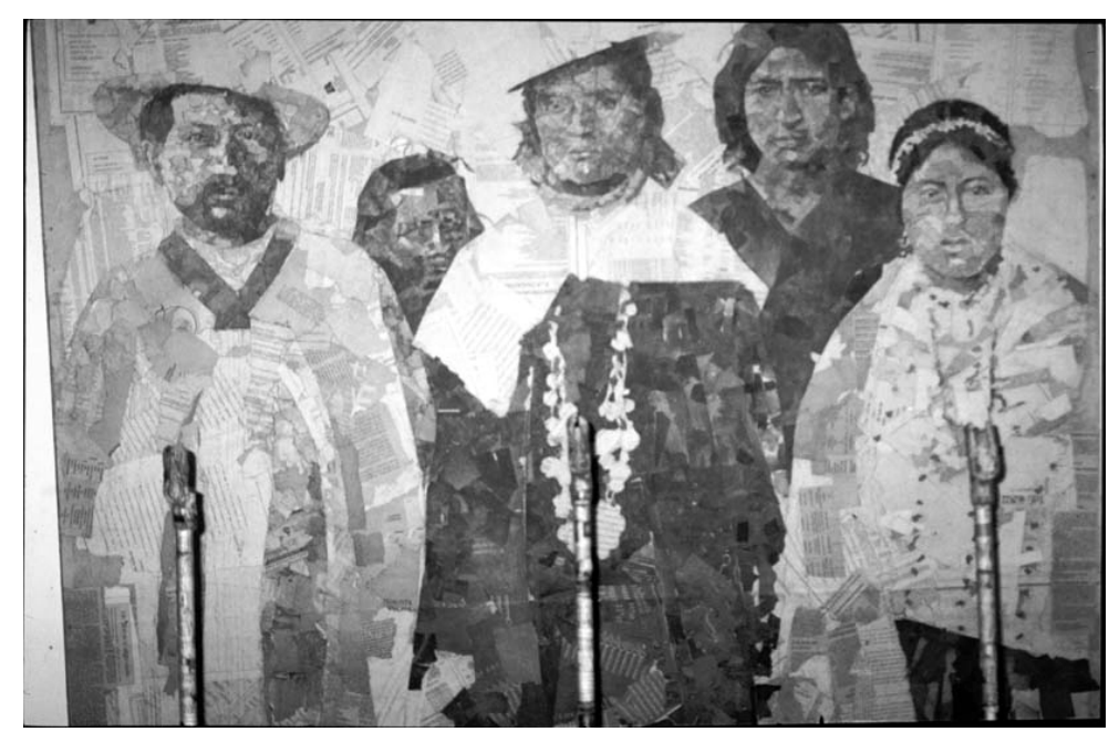
Fig. 2 : Luis Celi, Lazos de sangre en el país del olvido (Blood Ties in the Country of Oblivion, installation, 1996).

Despite the microphones positioned in front of the collage, there is no communication between the indigenous people and the viewer. The installation leaves us alone with its inquisitive urgency. The indigenous people are silently looking at us, yet the image is based on one of urban mestizo society's representations of Indians.