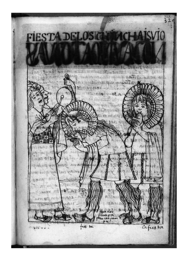
Figure 4 . The wawku taki dance of the Chinchansuyu using a deer-skull instrument (Guaman Poma de Ayala 1515/1516: 322).

Animism and perspectivism: Still anthropomorphism?