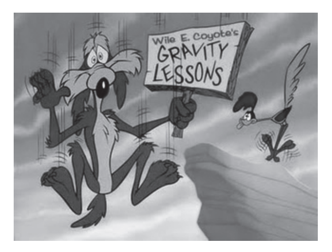
Figure 1. The perspectivist point of view. Anonymous (1996).

In this relational definition, the Amerindians transform the position of humans into that of peccaries; factually, they are still humans in identity. To have it as a perspectivistic ontology as Viveiros de Castro claims is, in a way, to confuse the object with the category and to think that categories create the world although they just give a specific account of it whilst still creating a different relational world. If we go a little further in this direction, we could say that consciousness in different ontological systems will not make it possible for a subject that runs off the edge of a cliff, as in cartoons for example, to keep running in the air until he realises that there is no more ground beneath him: he will just fall like any other material element attracted by gravitation. The only place where such a possibility exists is in cartoons and tales.