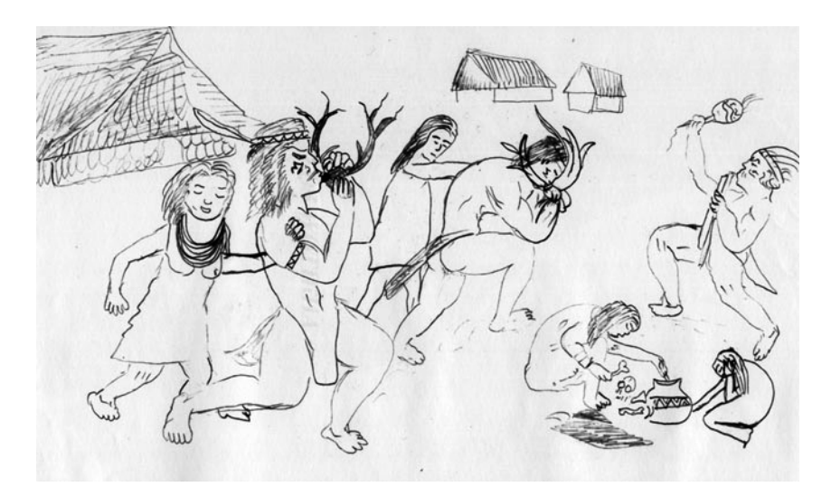
Figure 3. Cuiva-Guahibo death song played with a deer skull during a secondary funeral (drawing made by school-educated Indians (Ales & Chiappino 1997: fig.32).

the occasion. People play the deer-skull instrument during the ceremony (Ales & Chiappino 1997: fig. 32). This, obviously, has to be compared with the Miraña myth where the deer examines the bones of his brother who was eaten by the inhabitants of the ground.<sup>1</sup> The story of the myth and the collecting and comparing of the brother's bones can be seen in correlation with the Sikuani ritual and the unearthing of a deceased person's bones, now discharged from their flesh. Contrary to the Sikuani-Guahibo, the Miraña do not practice secondary funerals, but the idea still remains that the instrument is linked to death and, most of all, to bones.