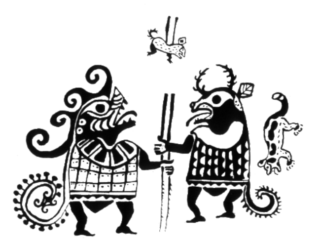
Figure 11. Moche anthropomorphic representation of two "deer" as "brothers in arms" (Peruvian coast, 100-800 A.D., Donnan & McClelland 1999: fig. 3.14).

spear placed in the same position, adornments copying the stag's spots, and a curved tail just like the deer. In other words, they are identical, but each element that makes them similar is shown as being different, a simile that only the global composition allows us to compare. They look familiar to one another as two brothers would, in the same way as the Miraña myth has one brother comparing his bones with those of his sibling. Strangely, these two figures correspond to the "brothers in arms" of Miraña mythology.