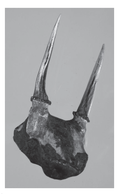
Figure 2. Ouko blowing instrument made out of a deer skull, here of a gray brocket deer skull (Mazama gouazoubira) (Miraña of Pt. Remanzo del Tigre, Amazonas, Colombia, 1993, personal collection).

In my 2002 contribution, I proposed an analysis of the myth in terms of anthropophagy, but also in terms of an association between bats (predators) and deer (prey) – where the child hanging from the roof in his hammock was a visual metaphor of a bat and the deer was the same prisoner of the cannibalistic ritual of the Tupian groups (as for the Miraña). I left aside the first part of the myth, which is rather complicated, but still interpretable thanks to the history of the slavery that existed in the area as of the 17<sup>th</sup> century.