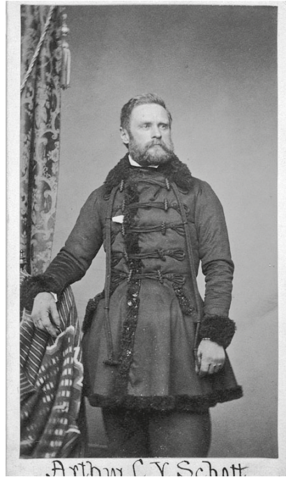
Figure 1. Arthur Carl Victor Schott.

In contrast to most regions, Yucatán supported the Second Empire. Additionally, the peninsula played an important role in the expansionist plans of Maximilian, who considered that in case of a US invasion he would move his capital to Yucatán, and also wished to extend his domains throughout Central America. 50 Therefore, Salazar arrived in the Mayab in September 1864 with a special agenda, plenty of power, and a good budget. Besides putting an end to the so-called Caste War, 51 a movement also known as the cruxo'ob uprising, the Commissioner wanted to improve the living conditions of the population through 'scientific measurements', and to attract European migration. Among his companions were four members of the Comisión Científica de Yucatán , which offered testimony to the importance given by the Empire to public works and the systematic exploration of the peninsula.