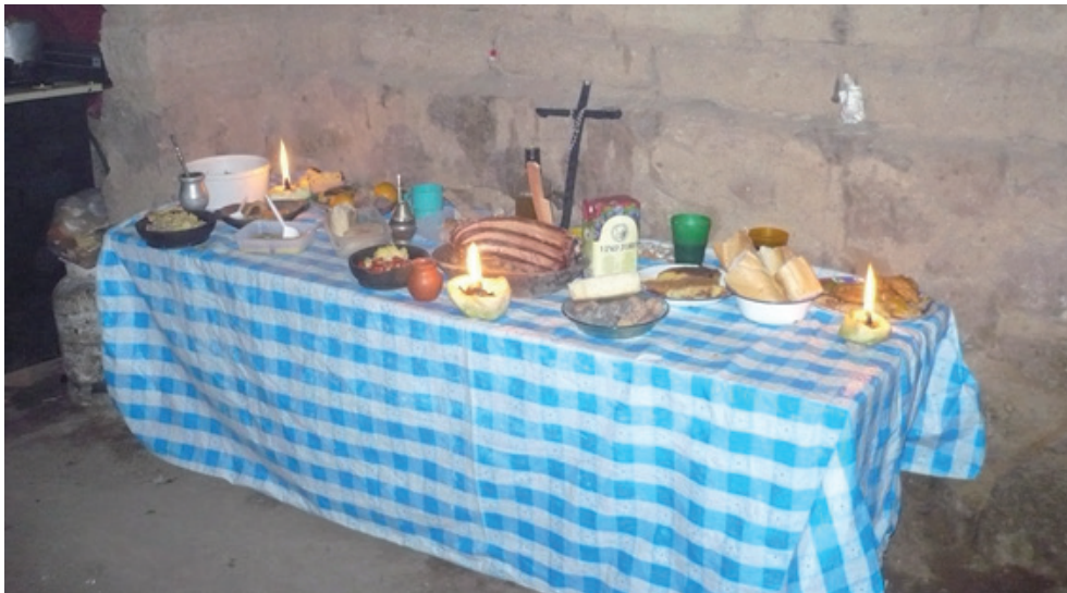
Figure 5. The dead souls’ table with the offered cooked food for the dead souls. Río Grande de Jasimaná, 1 st November 2011.

The activity of untying involves saints, household members and relatives in a giving and giving-in-return sequence of actions, whereas making offerings and burials connects people and souls, even if too intimate a relationship with the dead souls is dangerous for people who, after awaiting them, have to greet and banish them by noon on 2 nd November.