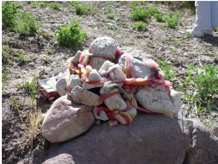
Figure 3. An apacheta made of white stones bound with coloured woolly strings and piled up. Río Grande de Jasimaná, 2011.

The branding itself is the central action, but several other actions are also very important as part of an effort to bring health and prosperity to the herd and their owners. This sequence includes actions such as burying pieces of the animals' ears, processing around the corral and binding stones to build an apacheta , to create a material connection between the herd and the Pachamama .