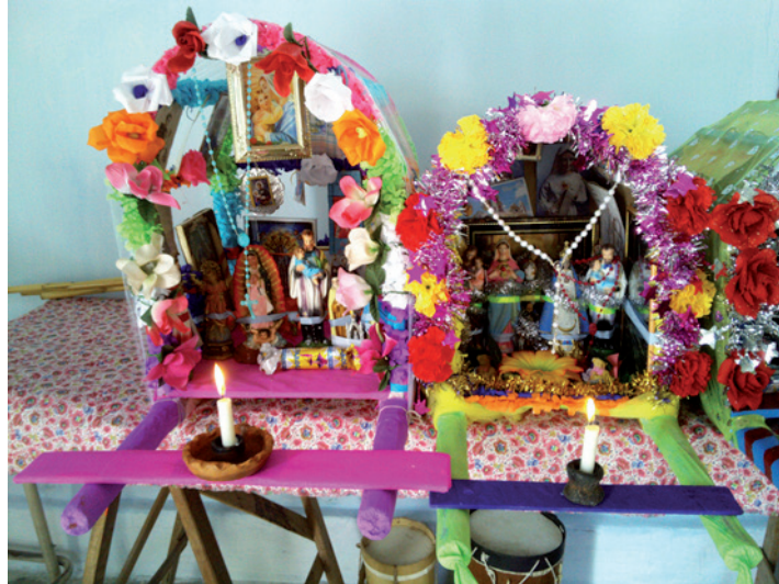
Figure 1. Andas (mobile platforms) containing the tied saints and Virgins lighted by candles in the chapel of the hamlet Río Grande de Jasimaná, 2011.