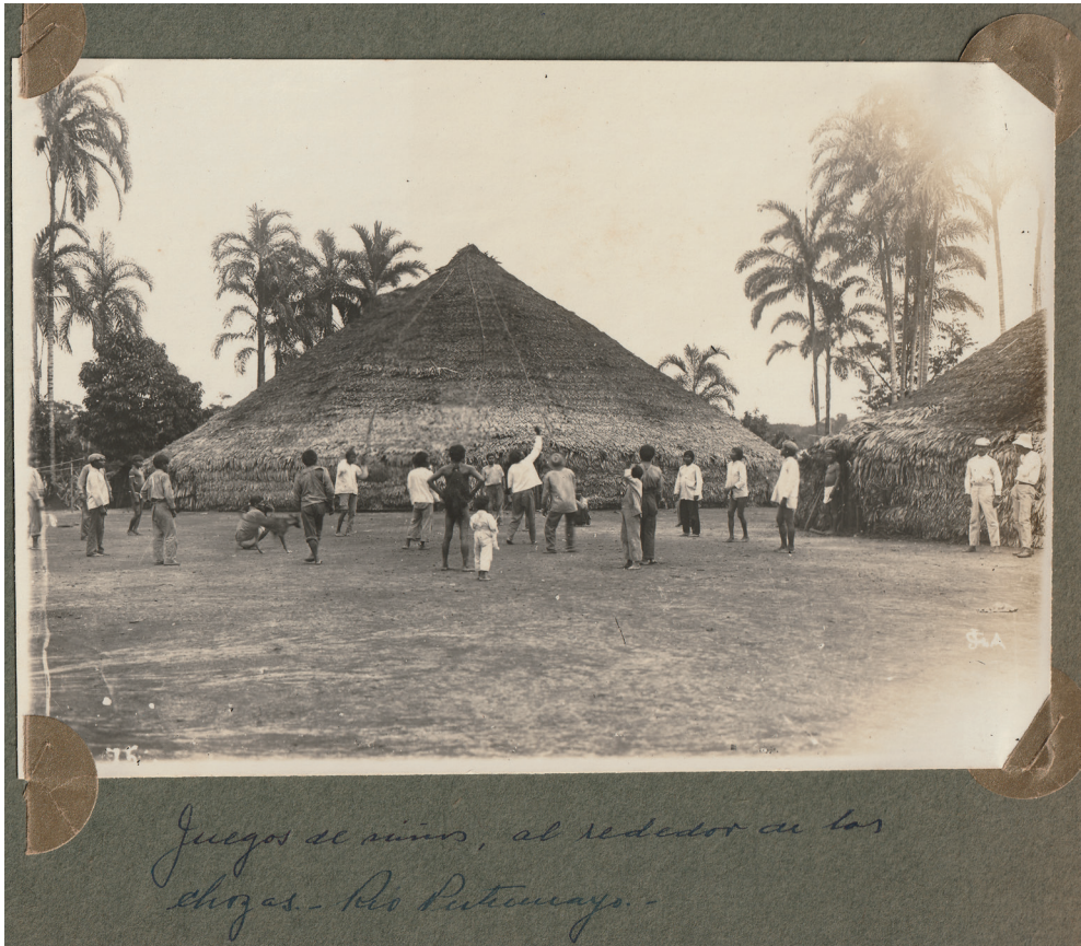
Figure 1. Image of the Putumayo rubber plantations produced by businessman Julio C. Arana as a propaganda tool. Photograph by Silvino Santos, 1910s. The signature “J.C.A.” and the numbering in the margins of the prints. Legend “Children’s games, around the huts - Putumayo River” (J. C. La Serna Collection).

the indigenous population. In other words, the contemporary exhibits overlooked the fact that these photo clichés were actually produced in order to visually reaffirm the image of indigenous people as ‘savages’ who were domesticated and introduced to national society through labor and trade. 34